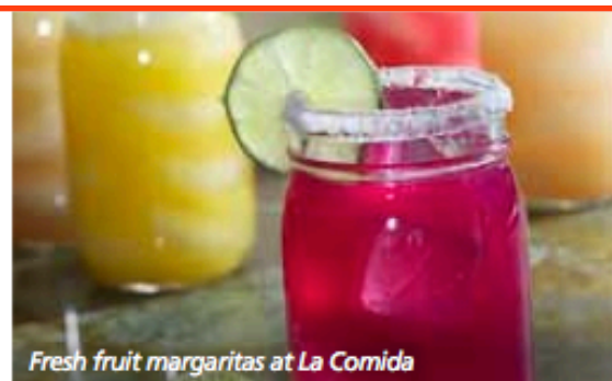
Fresh fruit margaritas at La Comida