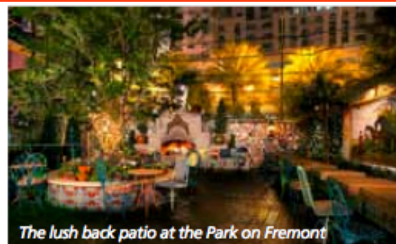
The lush back patio at the Park on Fremont

This bicycle-friendly gastropub took over the corner of Fremont Street and Las Vegas Boulevard. Dishes like stuffed burgers, Reubens and fried chicken and waffle sandwiches are hearty and flavorful. The drink menu is also impressive with 100 beer selections from around the world and specialty Bloody Marys. All of the cocktails are served in mismatched glassware. Sip them on the lush back patio, which is framed by ornate fencing and boasts a seesaw, a mosaic tile hopscotch and a Cinderella-style carriage blooming with pots of colorful flowers.